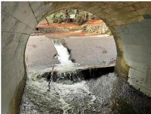
Remediate Outdated and Damaged Components of Old Mill Creek Culvert to Restore Salmon Passage

Below: view upstream of culvert, barrier at Old Mill Park