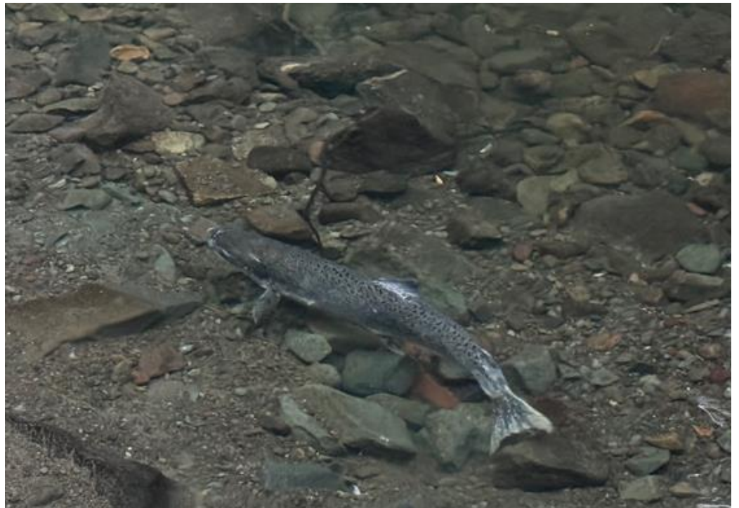
Magnificent, graceful, long fish-Chinook Salmon, made their way up streams to our excitement